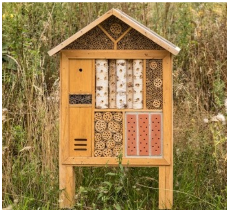
Multi-storey bug hotel