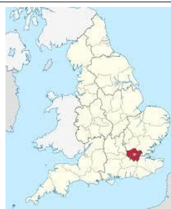
London in the UK