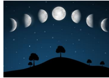
The Solar System